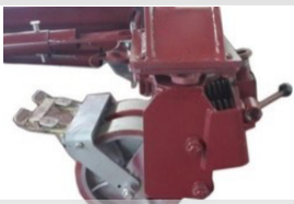
Heavy Duty Tread Wheels